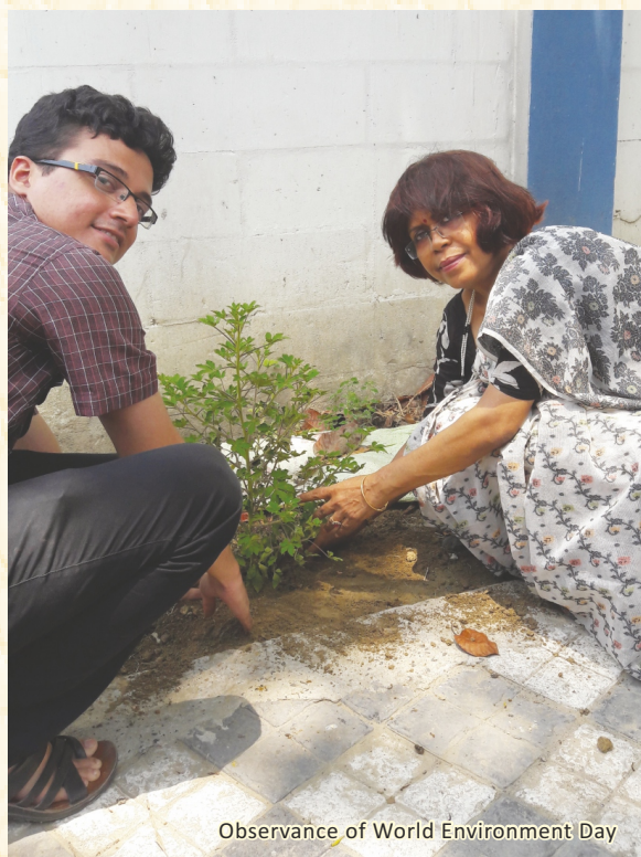
Observance of World Environment Day