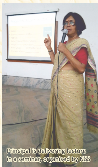
Principal is delivering lecture in a seminar, organised by NSS