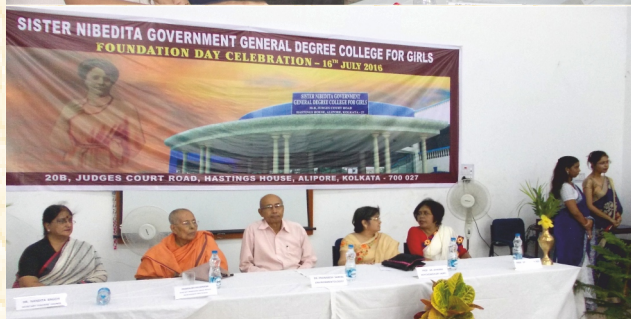
Glimpses of Celebration of College Foundation Day