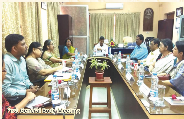
First General Body Meeting