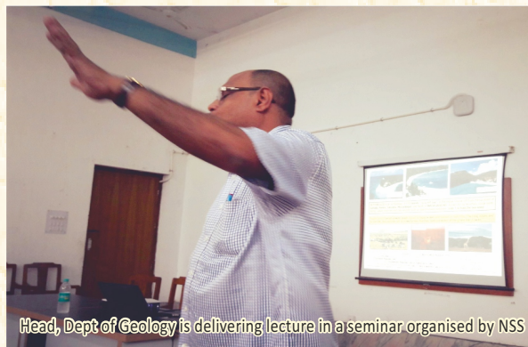
Head, Dept of Geology is delivering lecture in a seminar organised by NSS