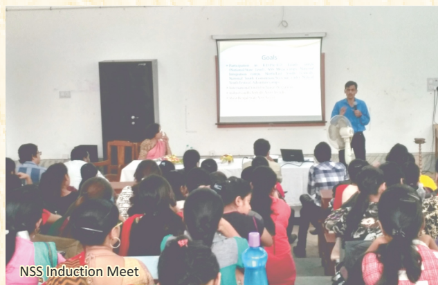
NSS Induction Meet