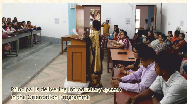
Principal is delivering Introductory speech in the Orientation Programme