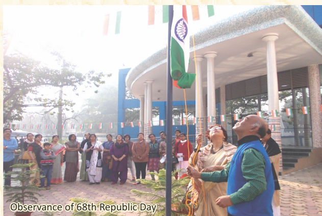
Observance of 68th Republic Day