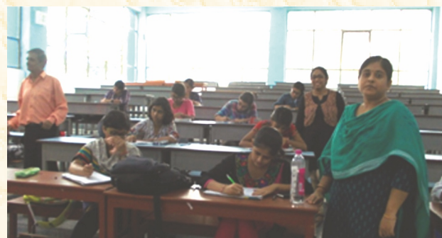
Painting competition and essay writing competition are going on