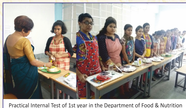
Practical Internal Test of 1st year in the Department of Food & Nutrition