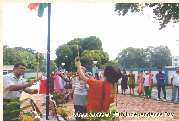
Observance of 70th Independence Day